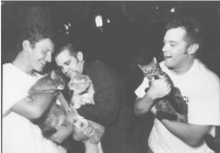
Sicko like kittys!